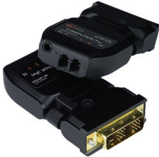
ST-2FODVI-LC Receiver and Transmitter